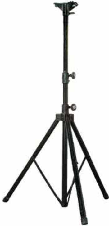
LA-337 IR Radiator Floor Stand