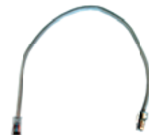
LA-393 RJ-45/CAT-5 Cable Preassembled, specify length