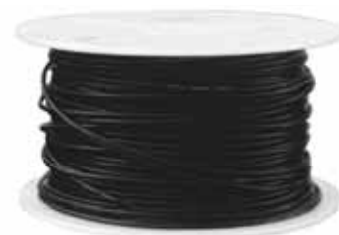
LA-112 RG-58 50 Ohm Coaxial Cable specify length