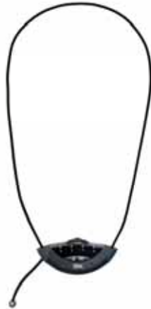
LR-44 IR Lanyard 4-Channel Receiver