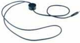
LA-166 Neck Loop