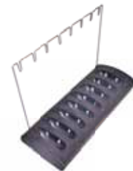
LA-351 IR 8-Unit Storage Station