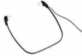
LBB 3441/10 Bosch Under-the-Chin Stereo Headphones