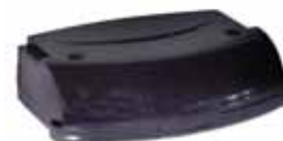
LA-152 IR Alkaline battery compartment