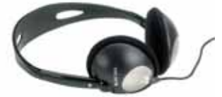
LBB 3443/00 Bosch Stereo Headphones