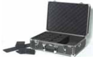
LA-320 Configurable Carrying Case