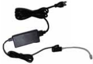
LA-205 IR Extended Power Supply (powers two LA-140 radiators) Note: You will only need the LA-205 if you are using more than two LA-140 radiators per LT-82 transmitter or if you wish to remote power the radiator(s).