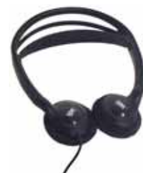
LA-165 Stereo Headphones