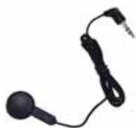
LA-161 Single Ear Bud