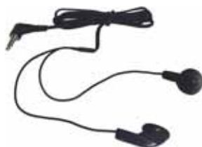
LA-162 Stereo Ear Bud