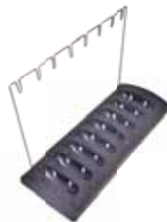
LA-350 IR 8-Unit Charging/Storage Station