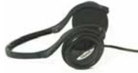
LA-170 Behind-the-Head Headphones