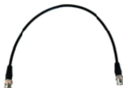
LA-391 RG-58/50 Ohm Coaxial Cable Preassembled, specify length