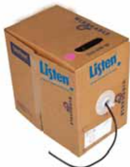
LA-70 CAT-5 Cable specify length